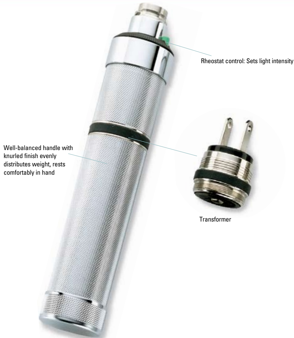
71000-C Convertible Power Handle